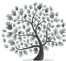
ANITA BANKS Commissioner, St. Louis